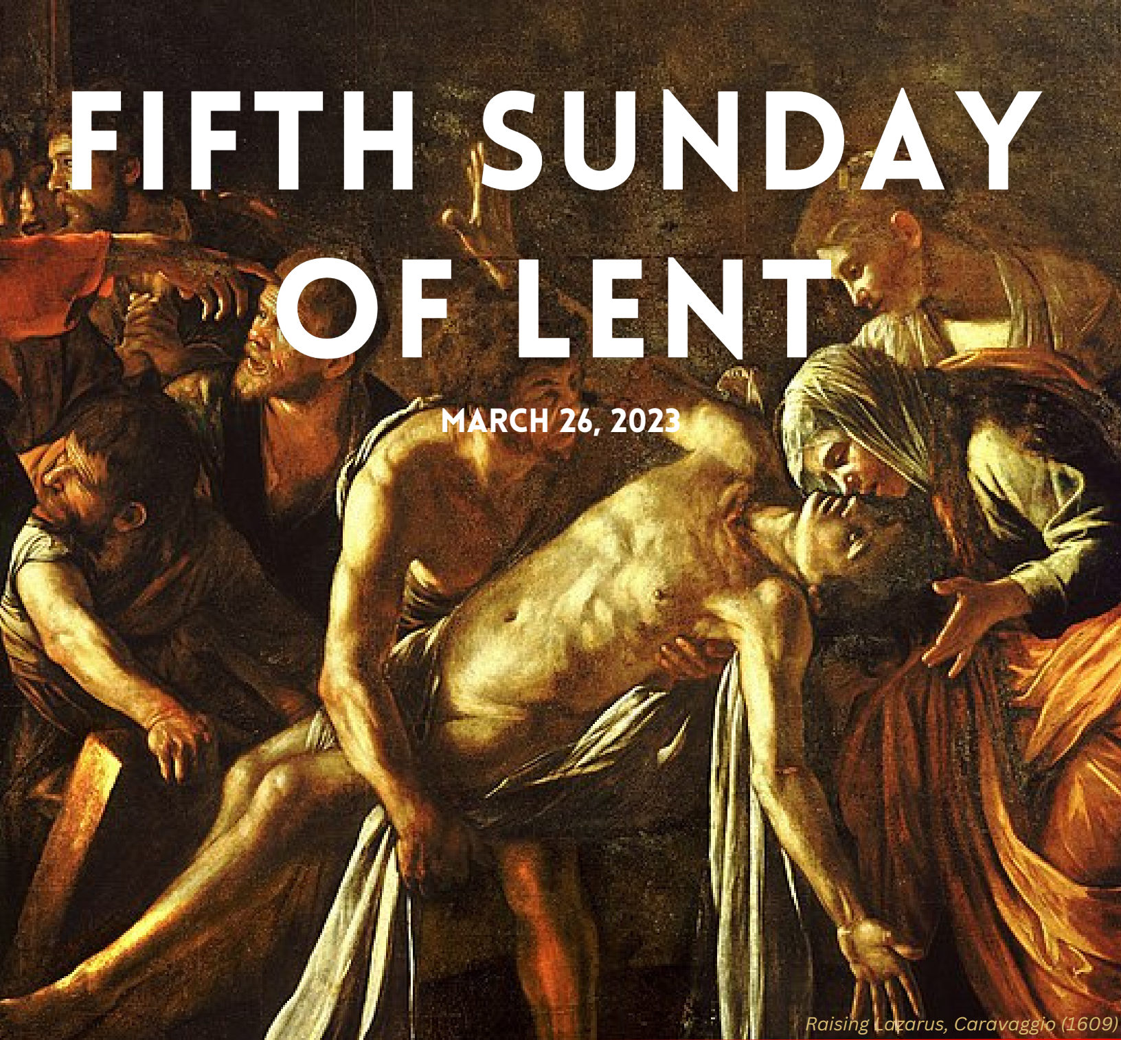
Raising Lazarus, Caravaggio (1609)

Jesus said to her, "I am the resurrection and the life. Those who believe in me, even though they die, will live, and everyone who lives and believes in me will never die. Do you believe this?"