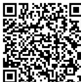
COVID Survey QR Code

We know, though, that COVID is here to stay. Eventually, we will lift this remaining precaution. The question is no longer if, but when? We will rely on the hope that a majority of people have been vaccinated against serious illness and death. To help us discern the best course for our church, please complete this brief survey. Thank you for your input and your patience.