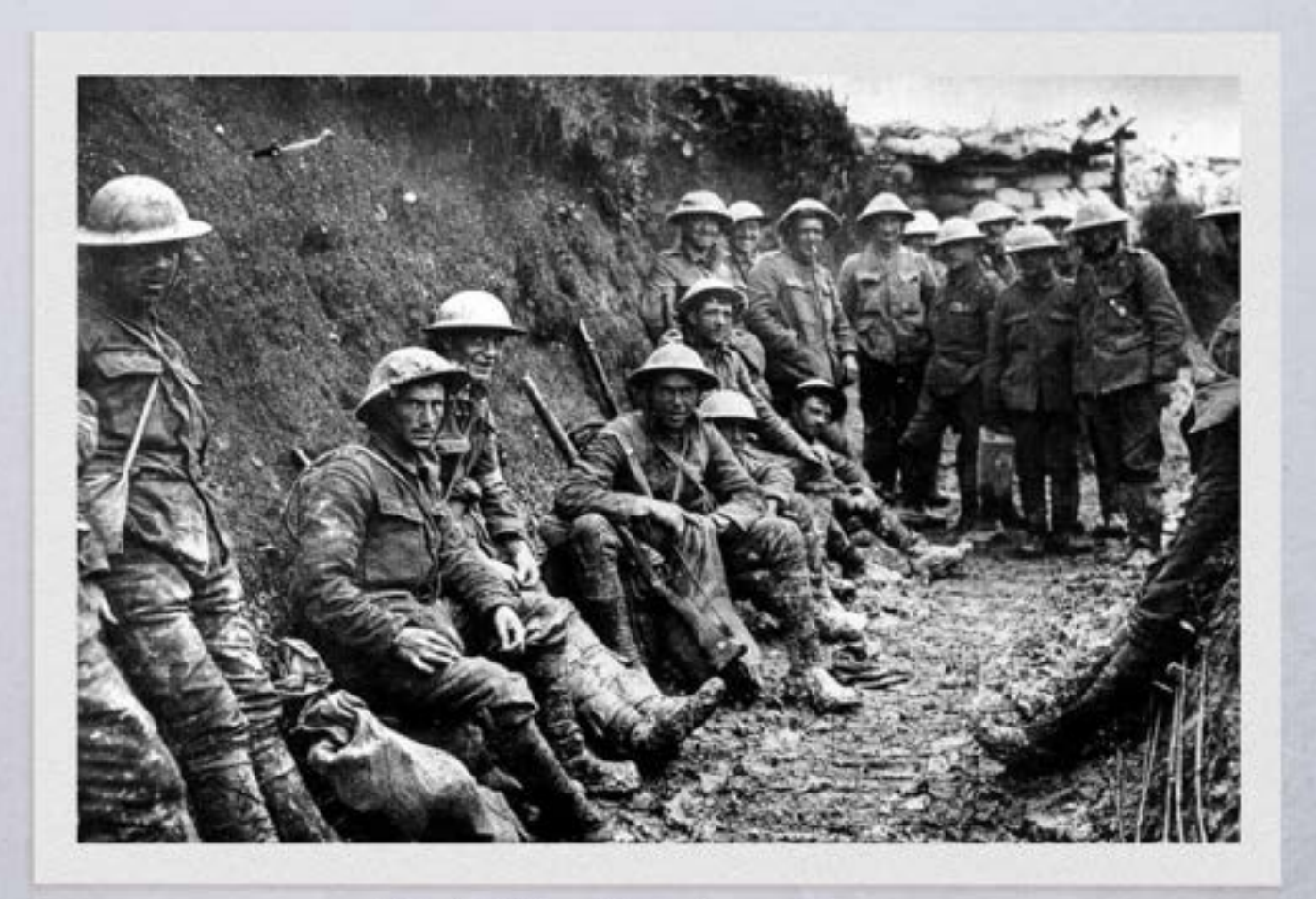
World War I trench warfare