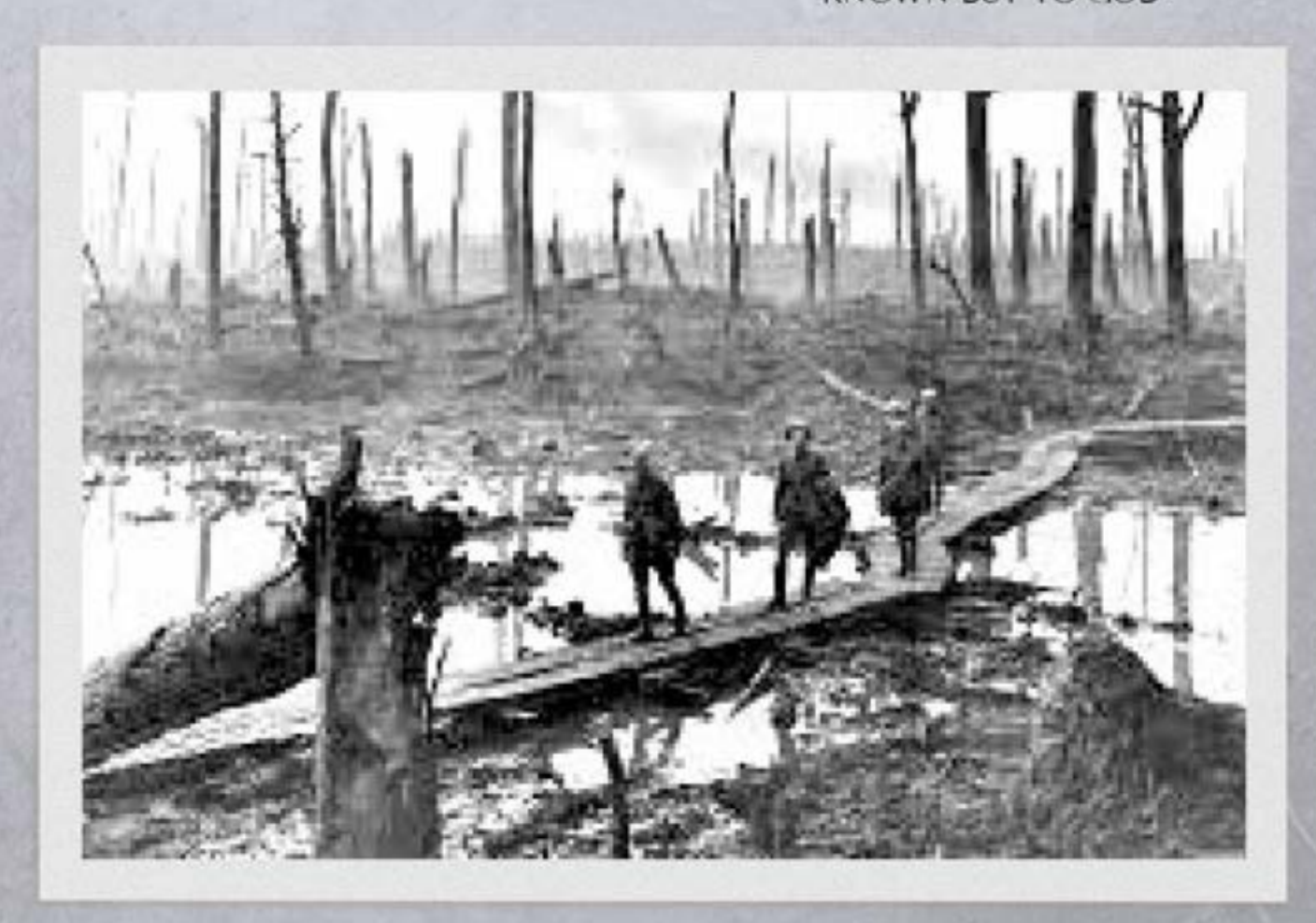
Battlefield on Messines Ridge, Belgium, 1917