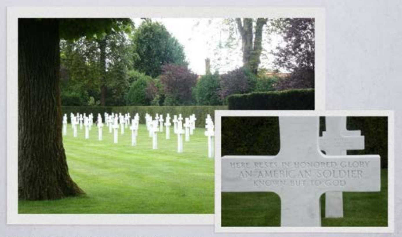
The American Cemetery in Waregem, West Flanders, Belgium, 2015