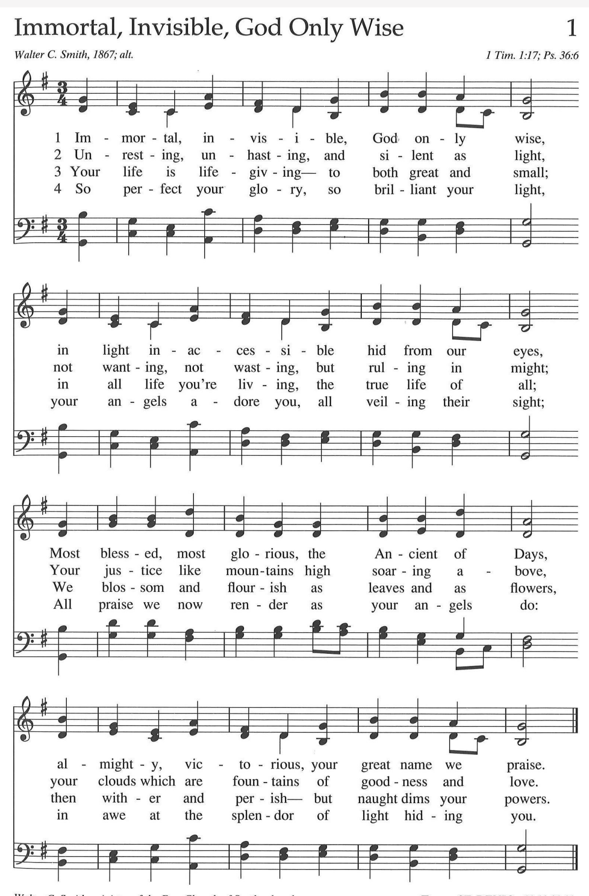
Walter C. Smith, minister of the Free Church of Scotland and later moderator of the Assembly, wrote poetry as a retreat from work and to say what could not be fully expressed in the pulpit.