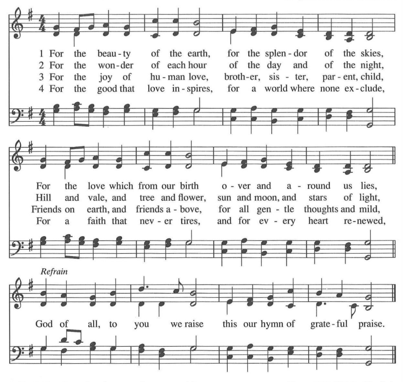
Folliott S. Pierpoint, author of numerous hymns, penned these verses near his native city of Bath, England, on a late spring day when flowers were in full bloom and all the earth seemed to rejoice.

St. 1–3, Folliott S. Pierpoint, 1864; alt. St. 4, Miriam Therese Winter, 1993